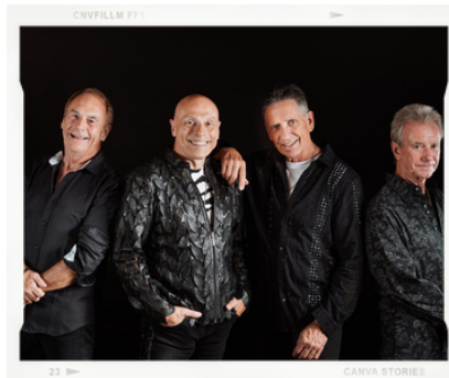
TOO MUCH SYLVIA