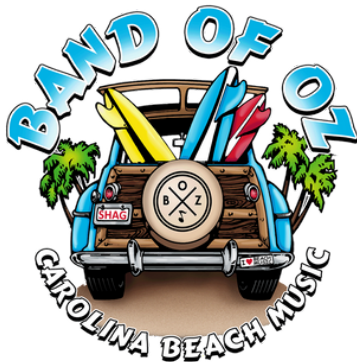
BAND OF OZ