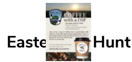
Coffee With A Cop